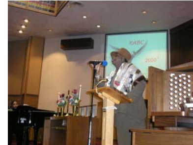
CAMDEN HIGH SCHOOL PRINCIPAL ACCEPTS DONATION AT KABC

Each year the Kaighn Avenue Baptist Church asks its congregation to give a donation to the person who is truly celebrated, Jesus. The request for this gift is to give to Jesus the cost of the most expensive gift that is planned for purchase during the holiday season. Each year this donation if earmarked for a cause that is beneficial to both the church and the community. While last years funds went to the purchase of a new organ this year the funds enabled some of Camden's and KABC's youth the chance to participate in a very special event. The Camden High School Marching Band was invited to compete in Washington D.C. for the opportunity to play at the presidential inauguration on January 20th, 2009. This opportunity while historic was also costly.