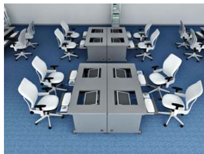
CONCEPTUAL IMAGE OF A HIGH-TECH LEARNING FACILITY.

program. The underlying theory is that the more we improve our capacity the more we will be able to improve the community and the more organizations communicate with each other the easier they can reach common goals.