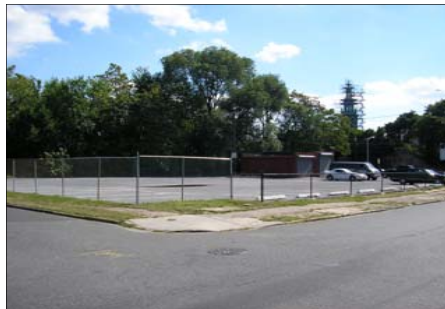
VACANT SITE ACROSS FROM KAIGHN AVENUE BAPTIST CHURCH

While this progress is real, the hardest part is now upon us. Amidst a financial crisis - strict building development plans that