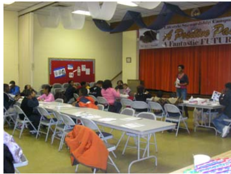
EVENING TUTORING PROGRAM AT KAIGHN AVENUE BAPTIST CHURCH

The rebuilding a community requires a multi faceted approach that utilizes the unique skill sets of a diverse group of dedicated stakeholders. Even more reversing the effects decades of blight has had on our community requires time and patience. One sure investment in the future of a community is an investment in its youth. The construction of any building or the redevelopment of any site cannot be successful if there is no one with skills to work in its offices; the acumen to balance its finances; the technical ingenuity to maintain its facilities; or the organization to lead its programs. For years Kaighn Avenue Baptist Church has administered various educational programs including its successful summer enrichment program. These programs have served the congregation and community well. However recent legislation, primarily from the Federal No Child Left Behind Act, allocates funding for students attending schools that do not meet federal standards. This funding provides eligible students the opportunity for free tutoring services. Unfortunately each of Camden's public schools do not meet the federal