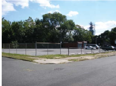
VACANT SITE ACROSS FROM KAIGHN AVENUE BAPTIST CHURCH

As we move into the sixth year of the Nehemiah Project, let me say that most legitimate visions do not happen overnight. When organizations are in the process of transformation, turnarounds typically take from three to five years. A new business is not considered viable until it has remained in business for five to seven years. When we look at building projects like the Nehemiah Project, the time can be even longer. For example, the Cherry Hill Mall and the Garden State complex were on the drawing boards of the city of Cherry Hill in the mid to late 1990's. The Mall was completed in 2009 and the Garden State complex has yet to be completed. When the Nehemiah Project began we spent a lot of time looking at alternative locations. Due to costs and the complexities of acquiring these properties, we decided to go ahead and utilize the two properties across from the Church.