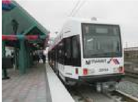
LIGHT RAIL STATION IN HOBOKEN, NJ

The Delaware River Port Authority has announced that it will continue to move forward with a light rail plan that will run from the Walter Rand Transportation Center, in downtown Camden, to Rowan University including a planned stop in the Gateway Neighborhood. The development will utilize the existing Conrail Line and would likely not be completed for at least eight years. This is an exciting development for Camden