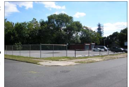
VACANT SITE ACROSS FROM KAIGHN AVENUE BAPTIST CHURCH